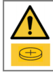
Proposed combination for IEC 62115