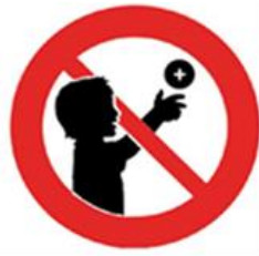
Proposed for ANSI C18.3 Part 1